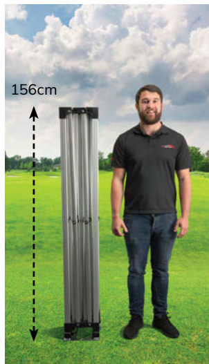
Our model is 176cm / 5'9" tall

Roof = 890mm Setting 2 = 1750mm Valance = 340mm Setting 3 = 1900mm Setting 1 = 1600mm Setting 4 = 2050mm